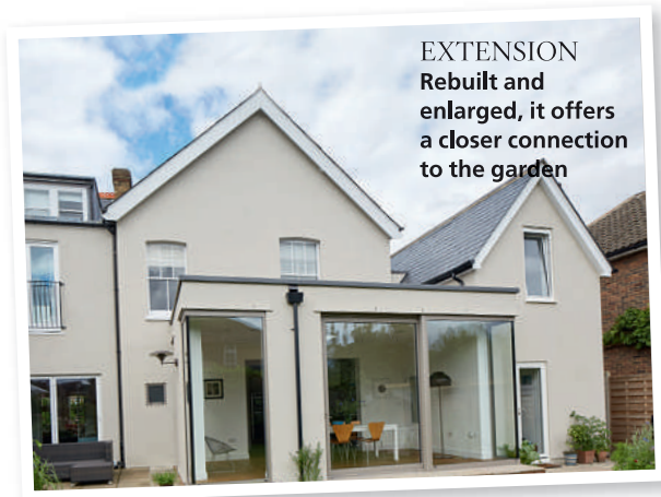
EXTENSION Rebuilt and enlarged, it offers a closer connection to the garden

‘There’s plenty of light and space in this modern kitchen, while the vibrant blue stools, patterned floor and warm colours give it lots of character.’