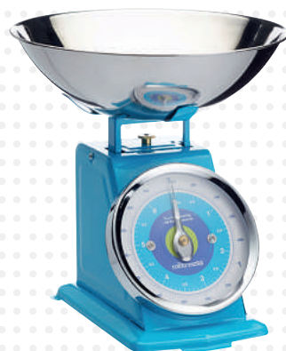
Mechanical kitchen scales , £16.99, Kitchen Craft