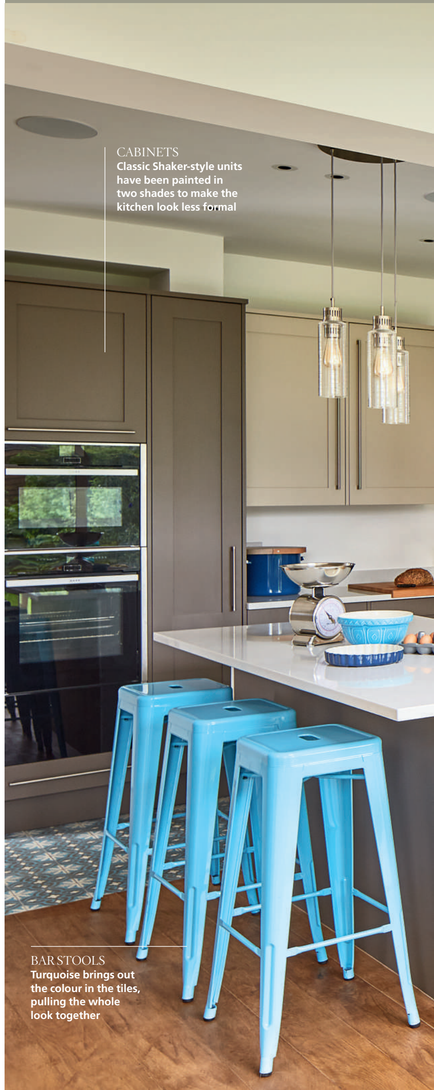
CABINETS Classic Shaker-style units have been painted in two shades to make the kitchen look less formal