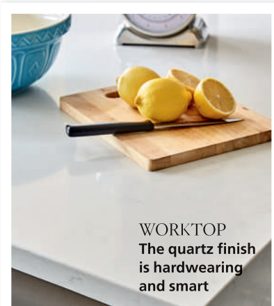
WORKTOP The quartz finish is hardwearing and smart