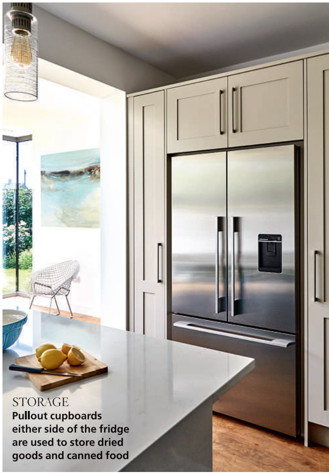
STORAGE Pullout cupboards either side of the fridge are used to store dried goods and canned food