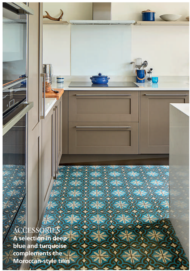
ACCESSORIES A selection in deep blue and turquoise complements the Moroccan-style tiles