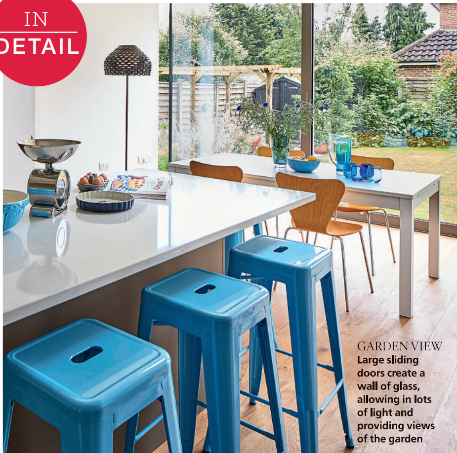
GARDEN VIEW Large sliding doors create a wall of glass, allowing in lots of light and providing views of the garden