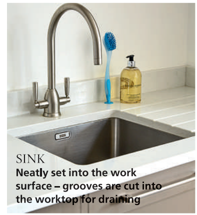
SINK Neatly set into the work surface – grooves are cut into the worktop for draining