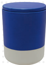
Richie Cobalt Blue stoneware storage jar, £12, Habitat