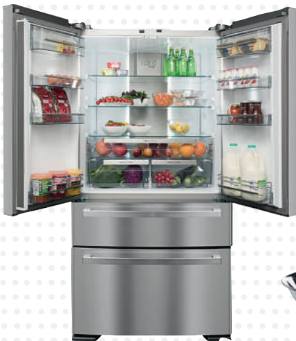
French door fridge-freezer , £1,518, Caple