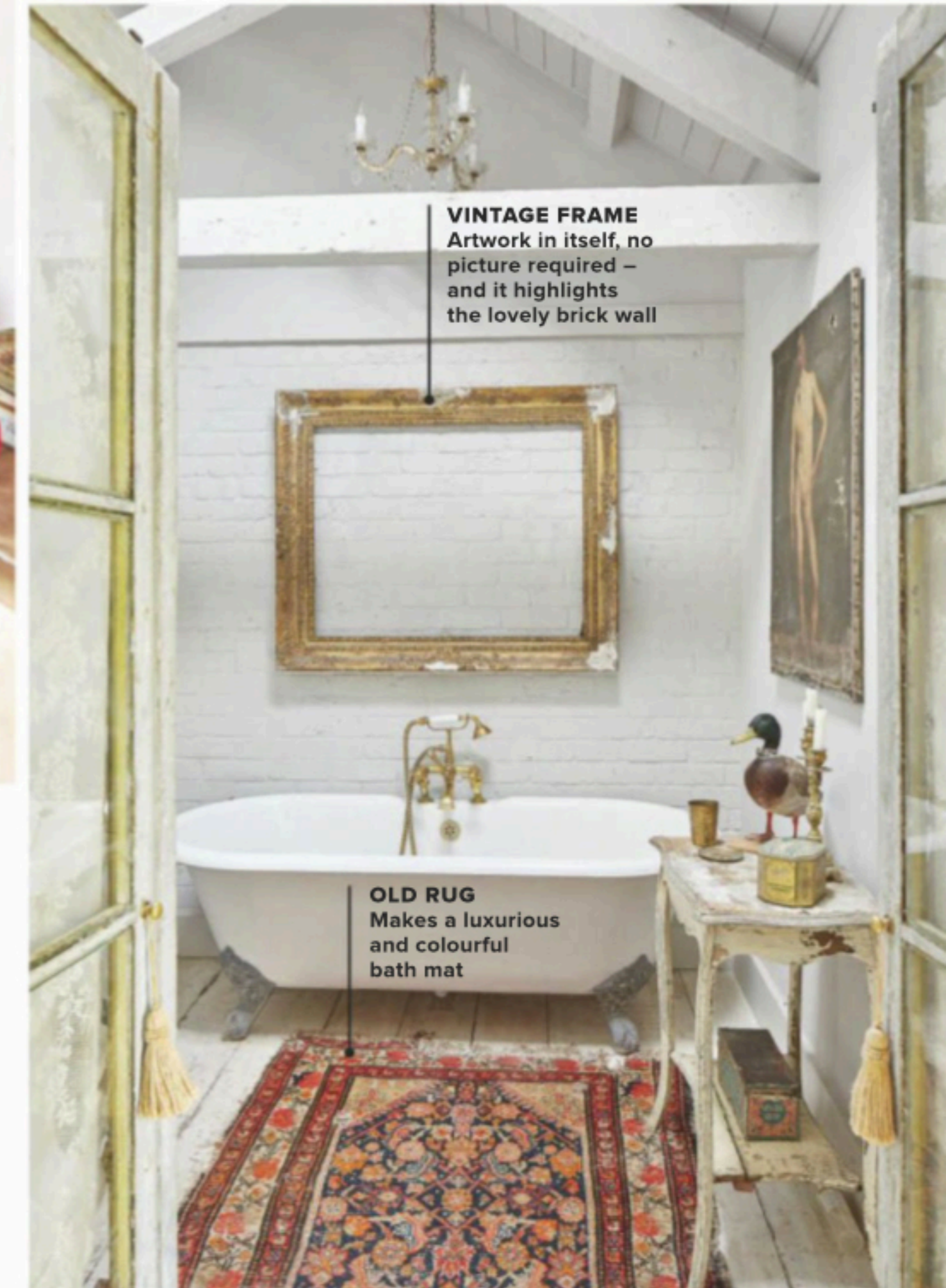
VINTAGE FRAME Artwork in itself, no picture required - and it highlights the lovely brick wall

“We've found there is a lot to be said for looking outside the box, taking everyday mundane objects such as scaffolding boards and repurposing them in your home to make shelves and flooring. Not only does it have a beautiful result unique to you, but it also doesn't cost the earth”