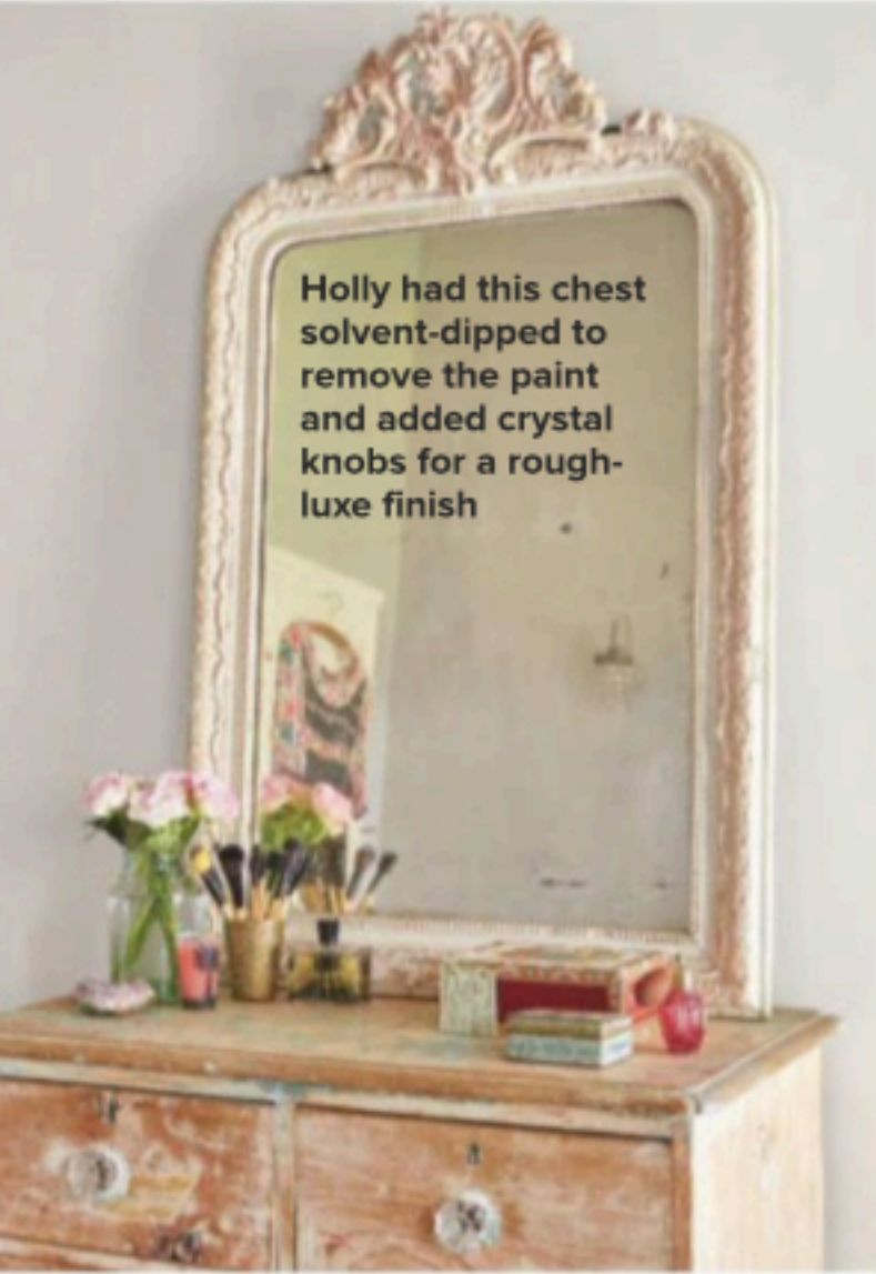
Holly had this chest solvent-dipped to remove the paint and added crystal knobs for a rough-luxe finish