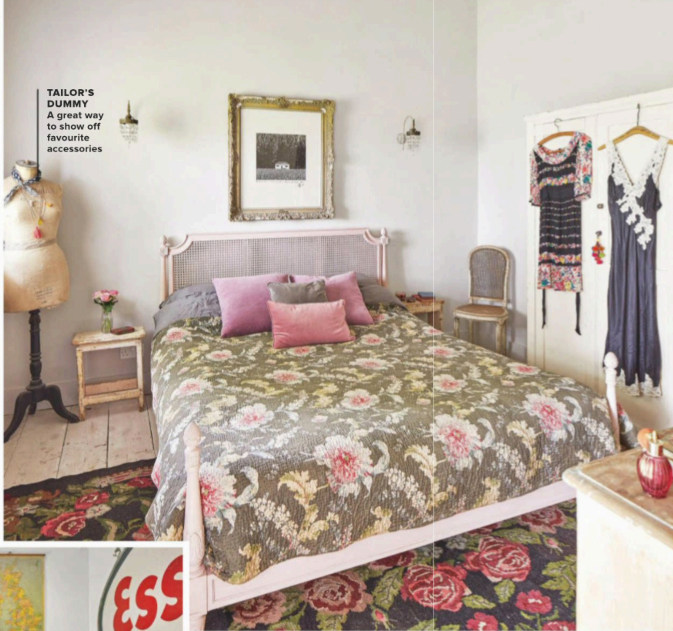
TAILOR'S DUMMY A great way to show off favourite accessories