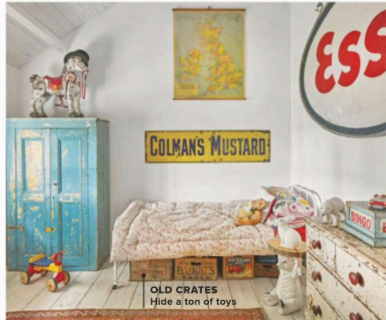
OLD CRATES Hide a ton of toys

Walls painted in Cornforth White Estate Emulsion, £43.50 for 2.5ltr, Farrow & Ball